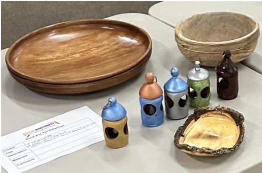
Neil McWilliams with a stained popcorn tree platter, a Ginkgo natural edged bowl, a mango wood bowl and lanterns colored with Deco-art wax.