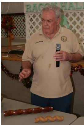
My apologies, I was unable to identify this gentleman.