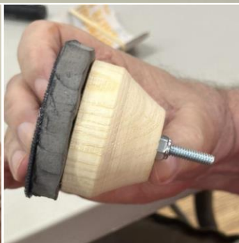
Ralph Thomas: Showed how to make a sanding jig from a carriage bolt, floor mat and hook and loop film.