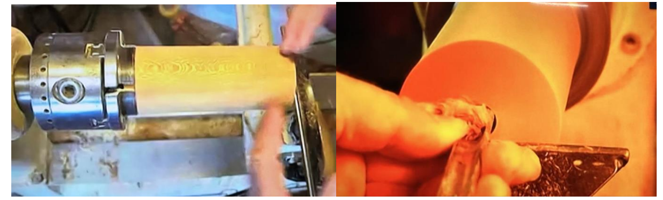
The end was squared and a central hole was drilled using a spindle gouge