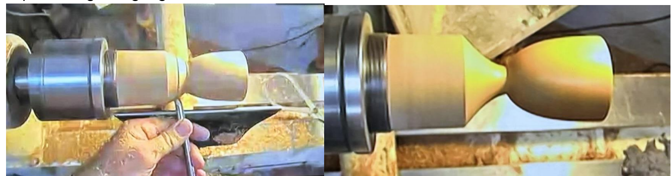
He will form the stem and base after sanding and finishing the goblet bowl and sides.

When he gets near bottom he uses the wide side of the gouge to form the bottom curve. He uses an inspection light to gauge wall thickness.