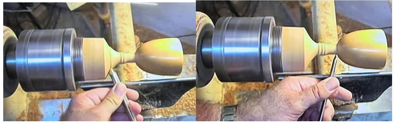
He turns the stem down in degrees stabilizing the bowl if needed with a styrofoam ball & live centre.