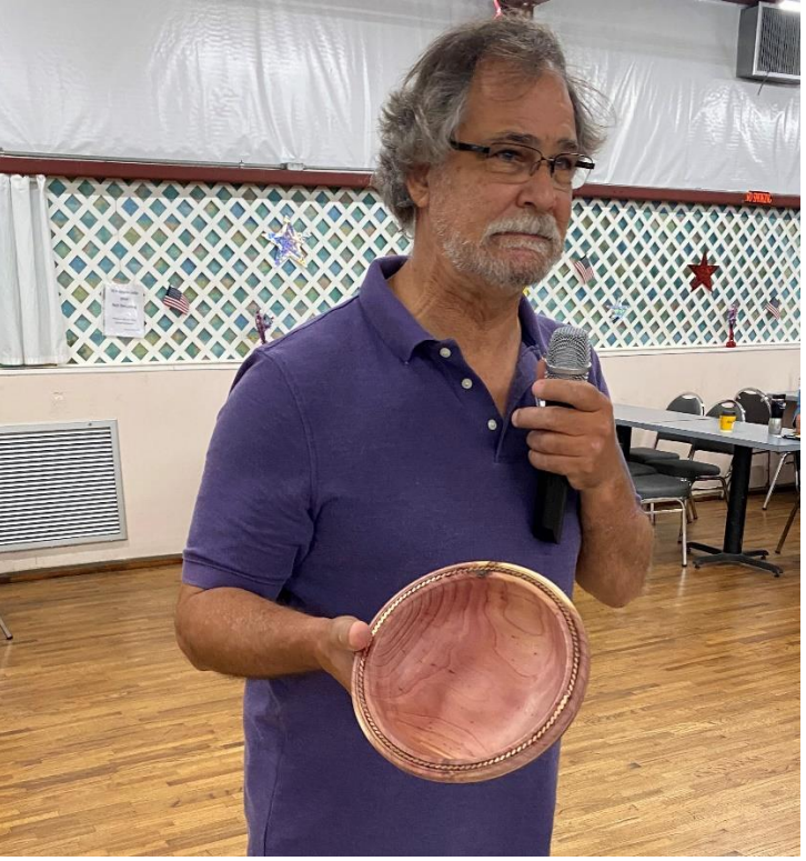
Jim: waddayathink, does it go with my purple shirt??