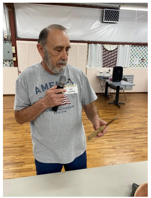
Kim's homemade texturing tool