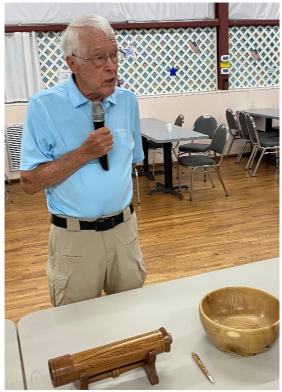
Al: I haven't show you this kaleidoscope