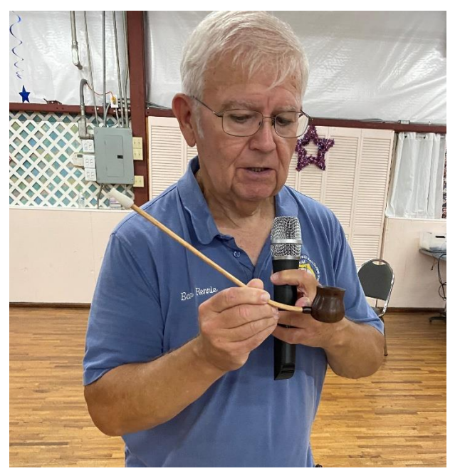
Earl: start with a pipe, work up to a hookah