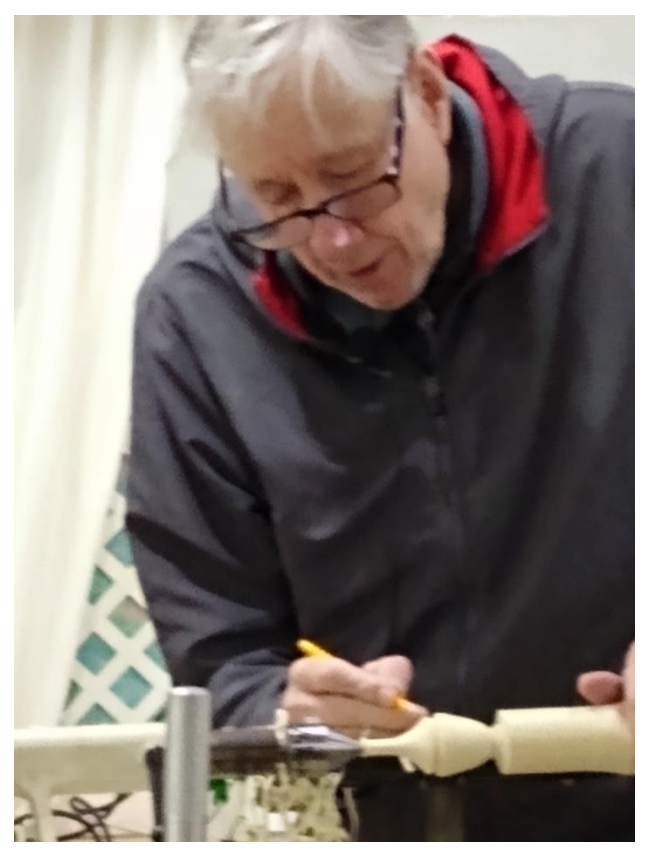
Using spindle techniques, project was a sit up mouse, with applied eyes and ears.