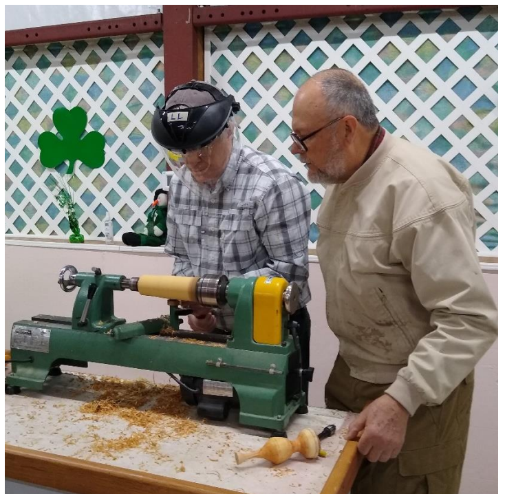
All our beginners did great, while some of our mentors were calmer than others