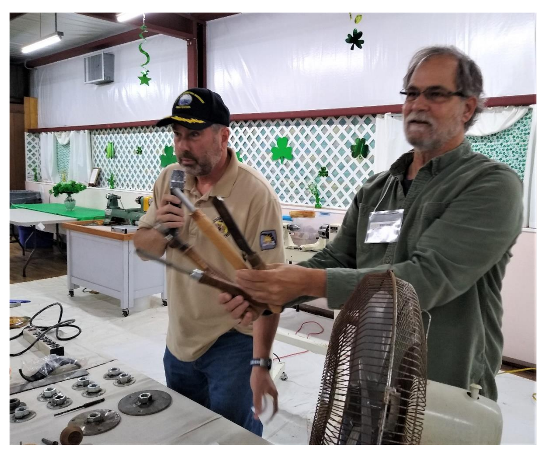
Kitchen or shop, your choice!