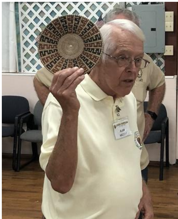
Al McCoy's exquisite first effort with a basket illusion plate