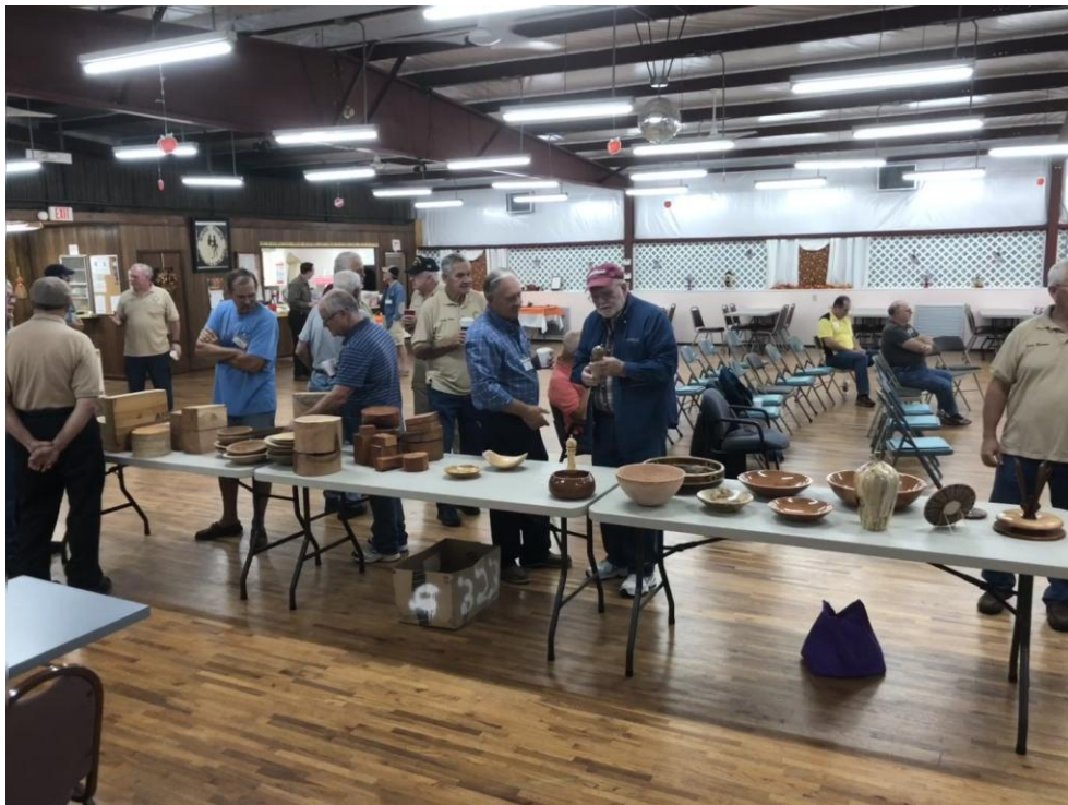
Members looking over gallery and auction items pre-meeting